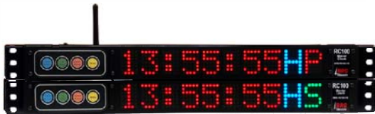
RC102 Redundant Master Clocks